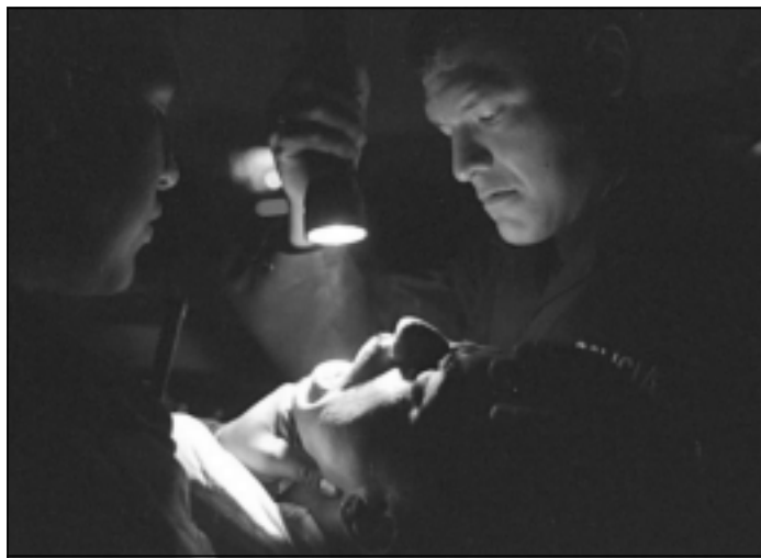
Tijuana police use a flashlight to search a pedestrian for drugs in one of the city's poorer areas.

For example, one of the first cases CEFPRODHAC received in 1997 was the torture and probable mur-